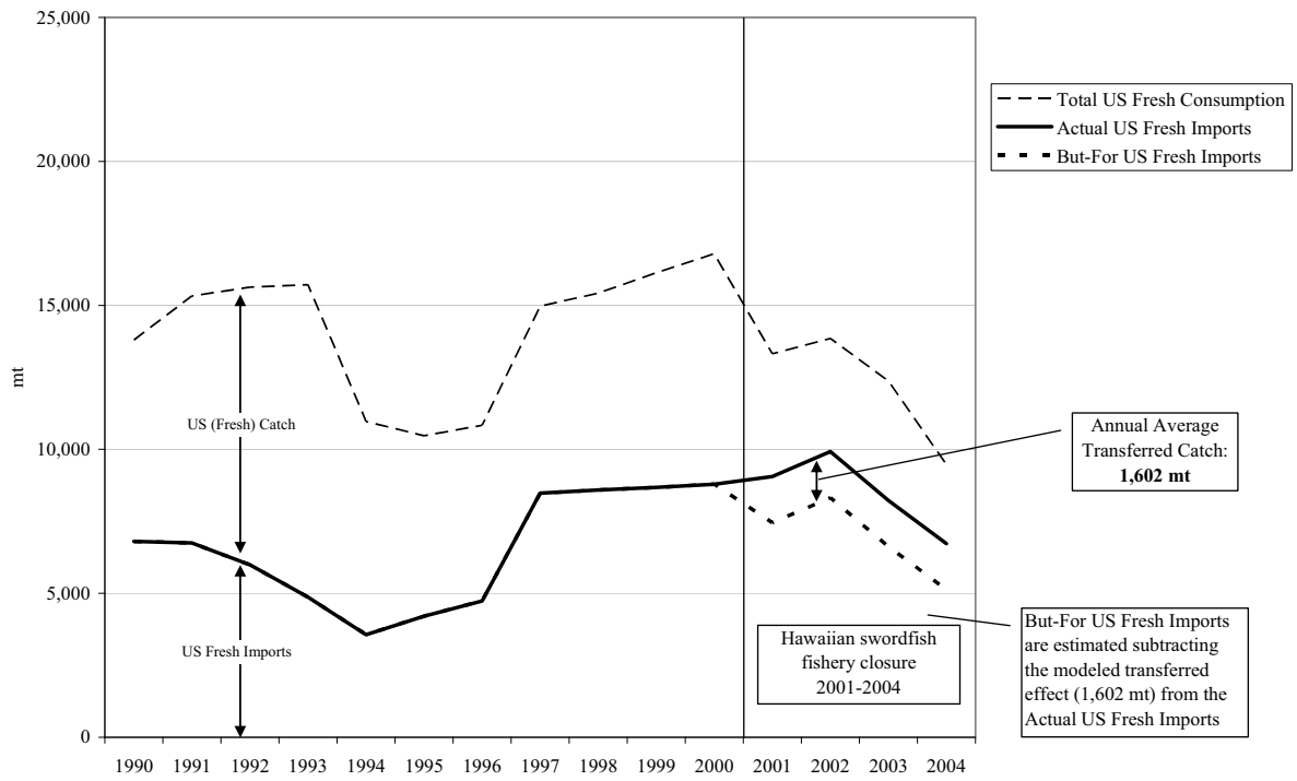
Figure 3: Estimated Transferred Swordfish Catch – Actual Demand Conditions